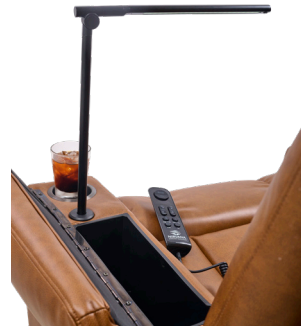
Power Port + LED Reading Light