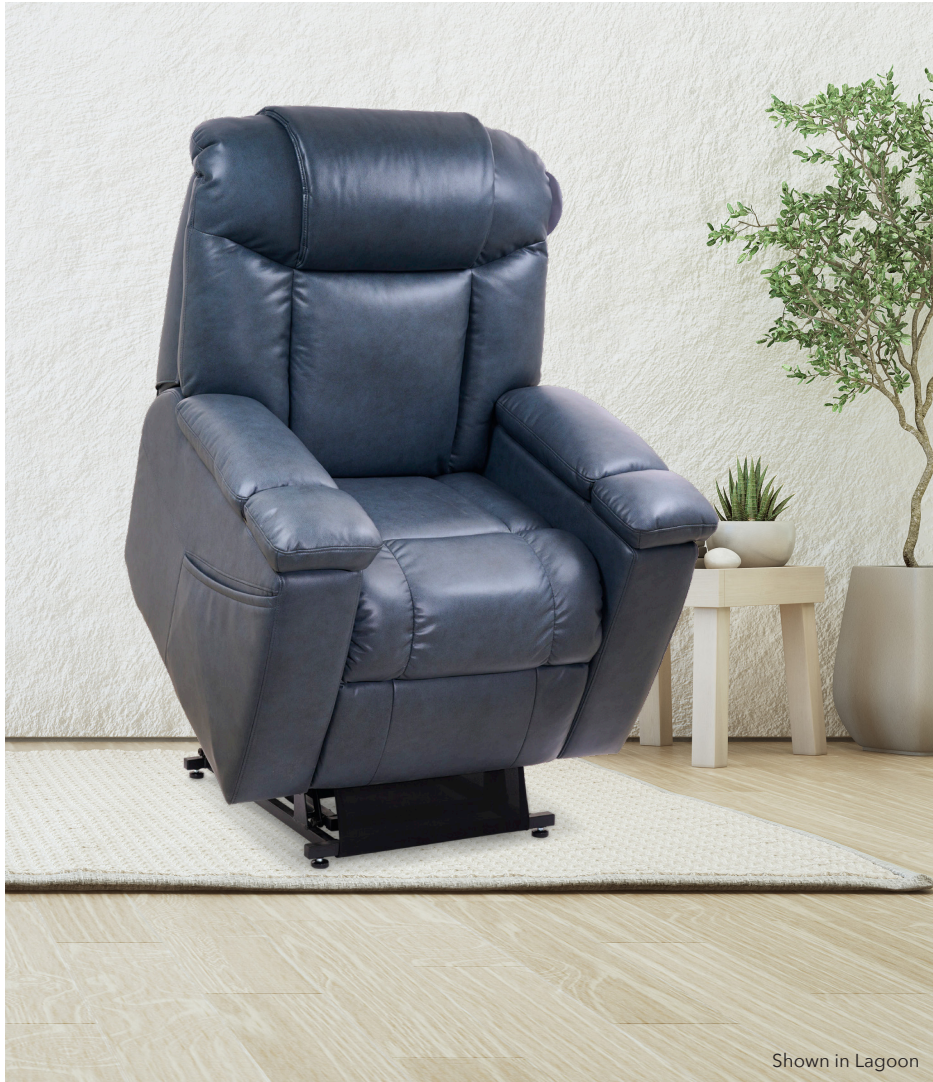
Shown in Lagoon