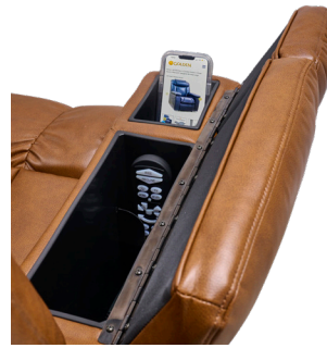
Right Arm: Wireless Charger & Storage Compartment