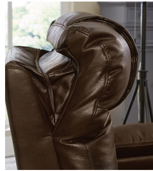
Adjustable Headrest & Lumbar