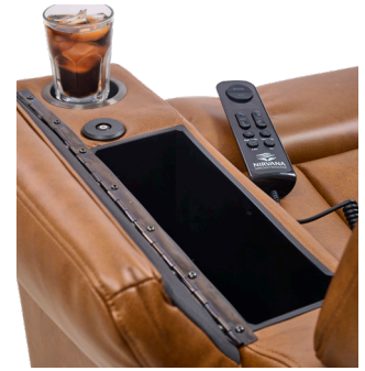
Left Arm: Cup Holder, Power Port & Storage Compartment