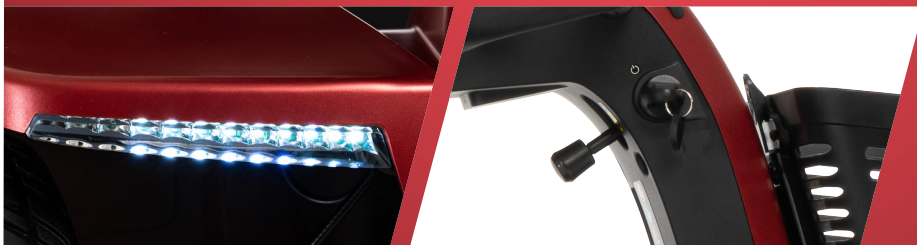
Full LED light package